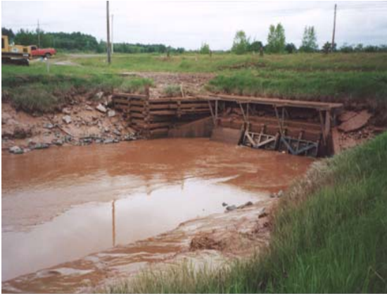
Figure 1. Downstream view of aboiteau system with three tide gates.