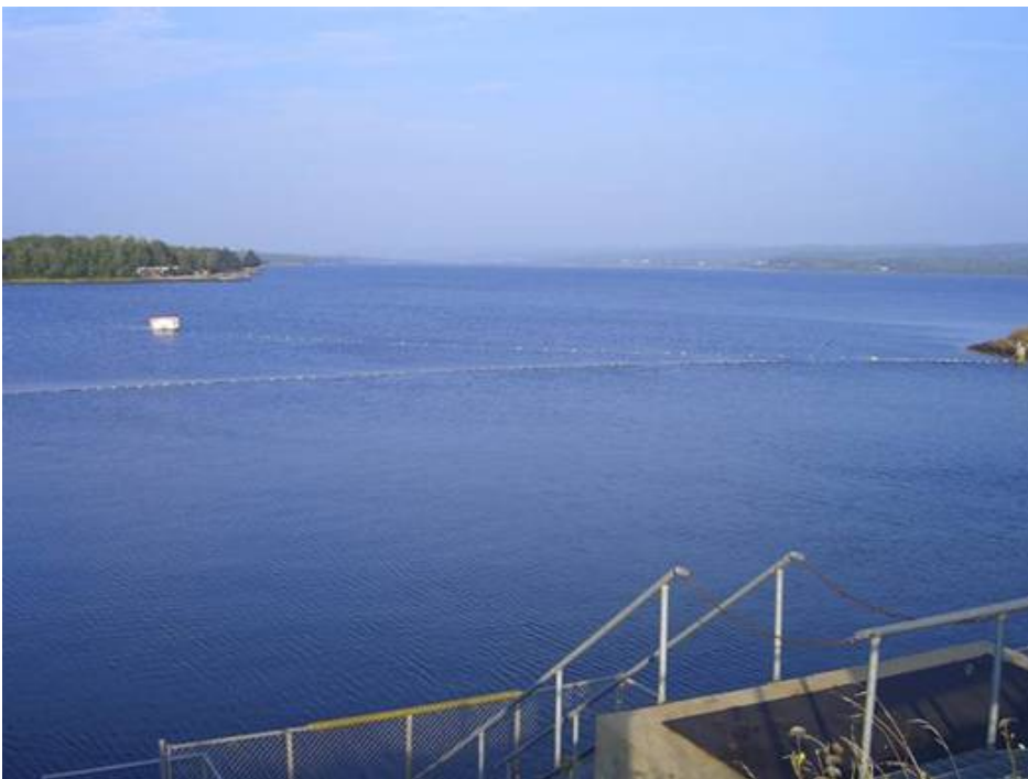
Figure 3. Upstream of crossing, view of Annapolis River system.