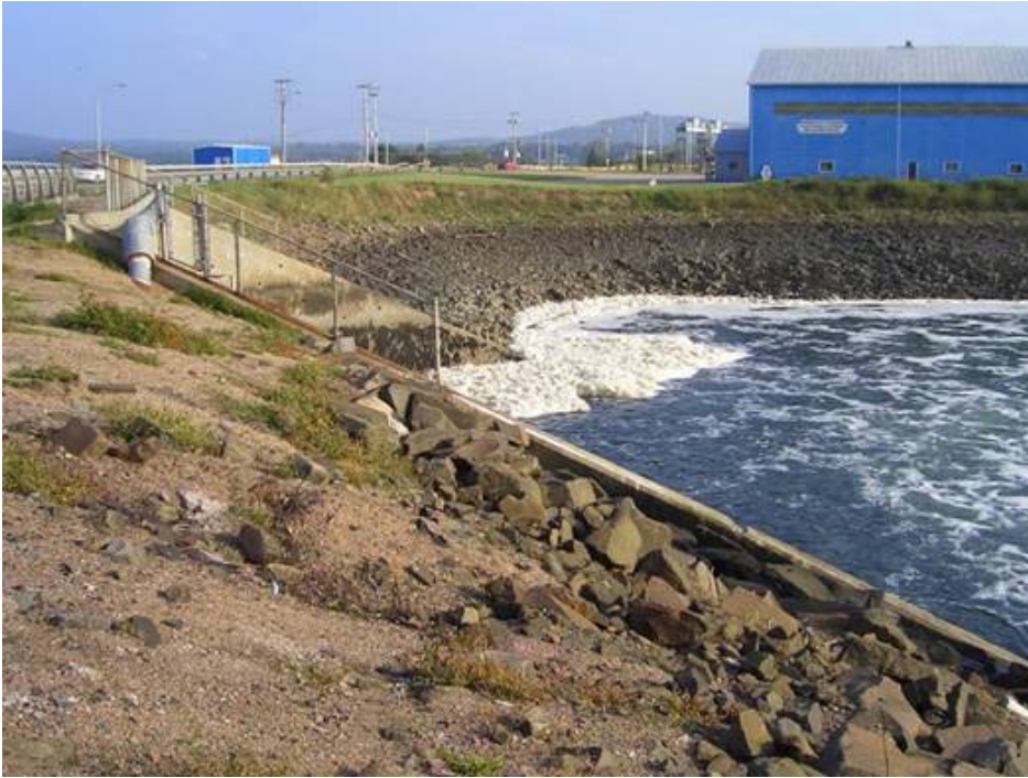
Figure 2. Downstream view of crossing.