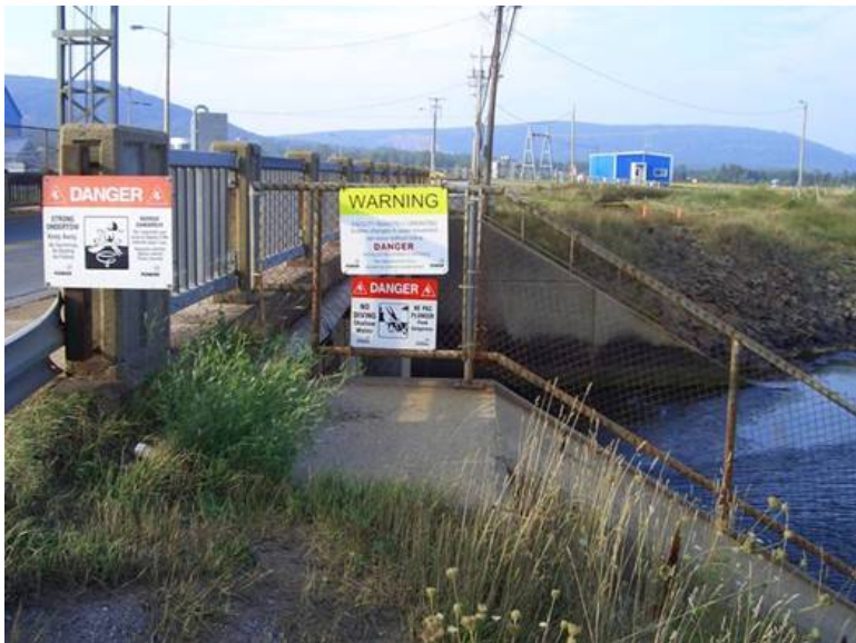
Figure 1. Upstream view of crossing