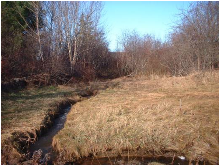
Figure 3. Downstream view of crossing