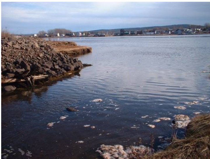
Figure 4. Downstream of crossing