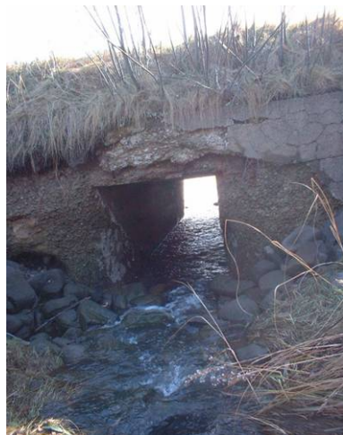
Figure 1. Upstream view of crossing