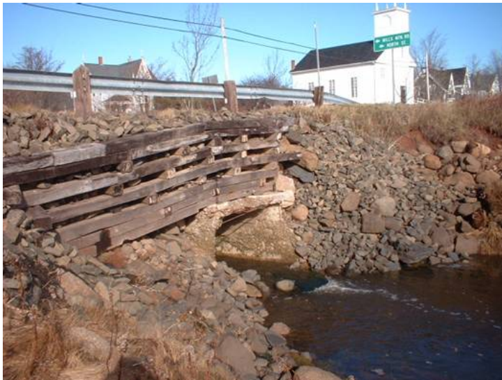
Figure 2. Upstream of crossing