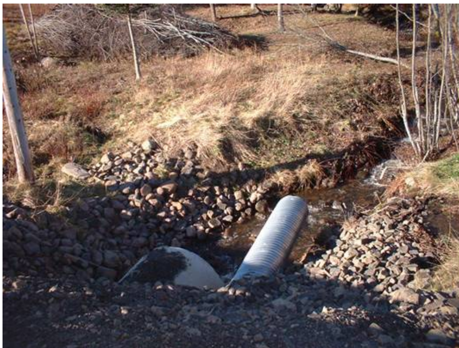
Figure 3. Upstream of crossing