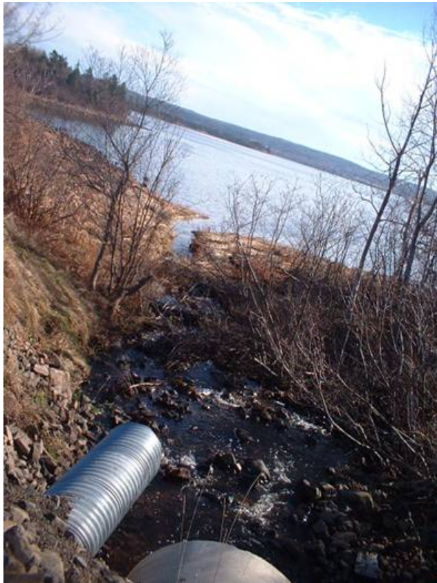
Figure 2: Downstream of crossing