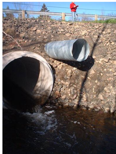
Figure 1. Downstream view of crossing