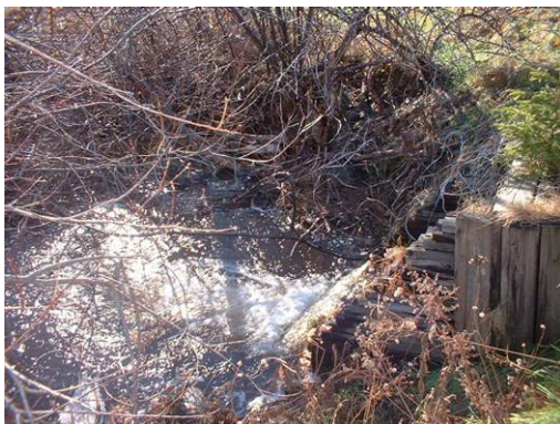
Figure 1. Downstream view of crossing