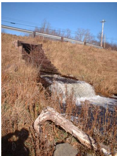
Figure 1. Downstream view of crossing