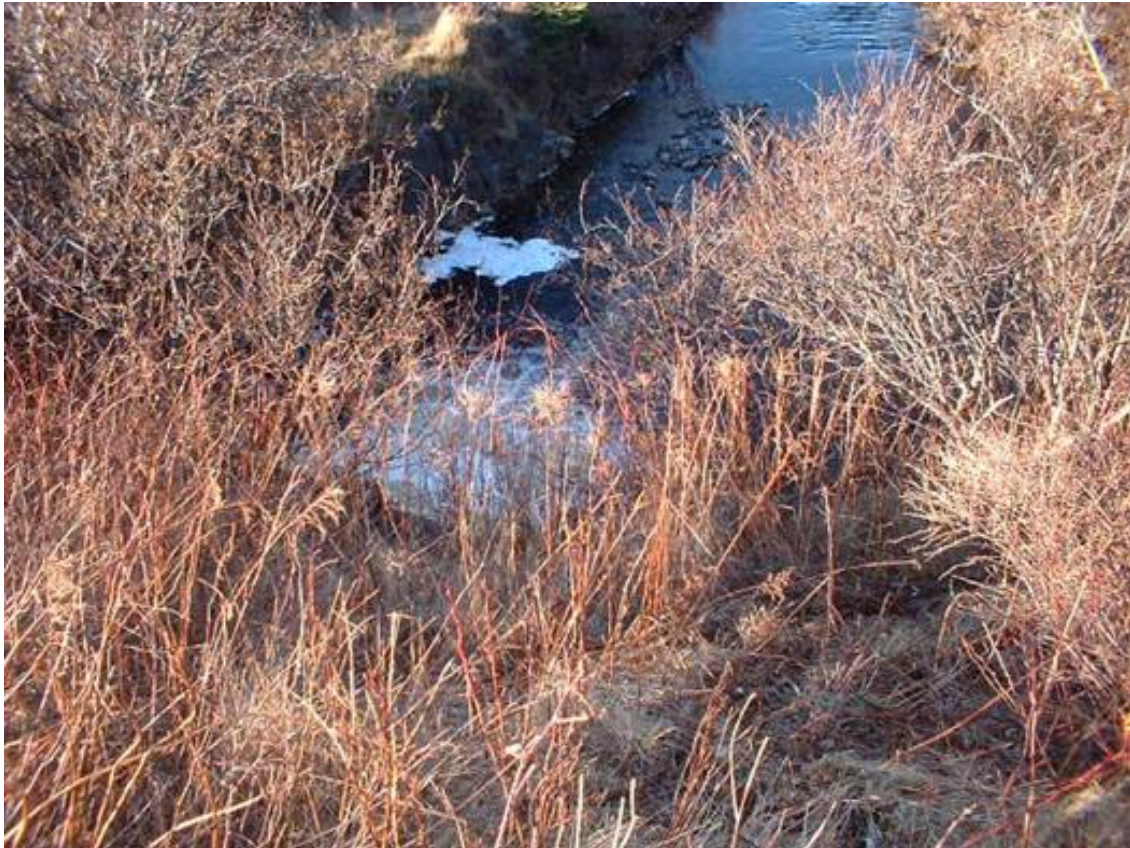
Figure 3. Upstream of crossing