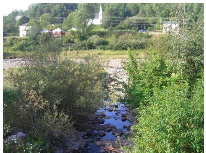
Figure 2. Downstream of crossing