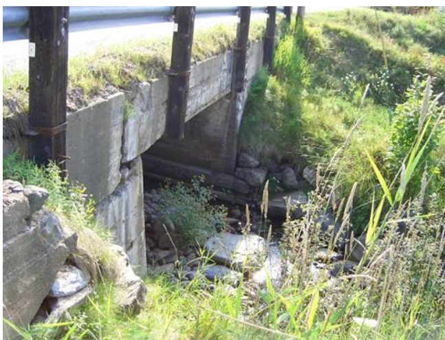
Figure 1. Downstream view of crossing