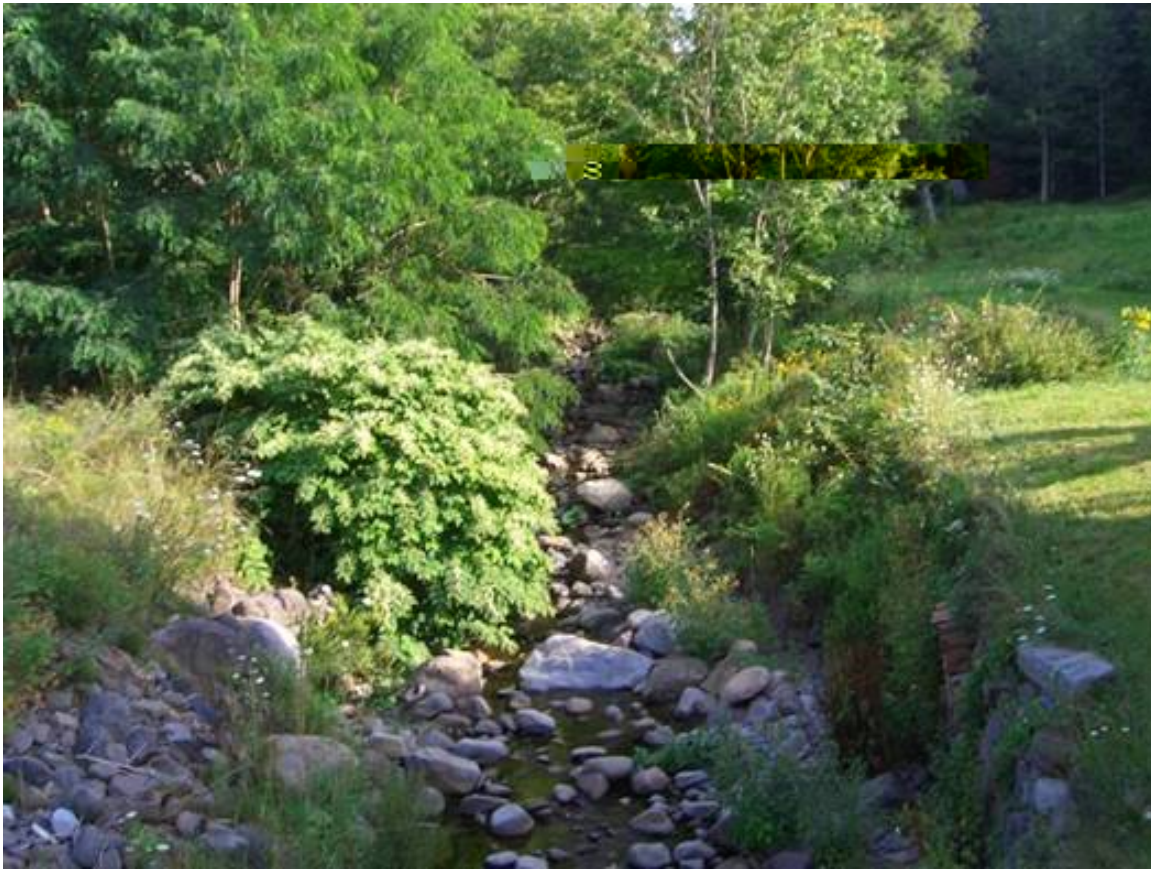
Figure 3. Upstream of crossing