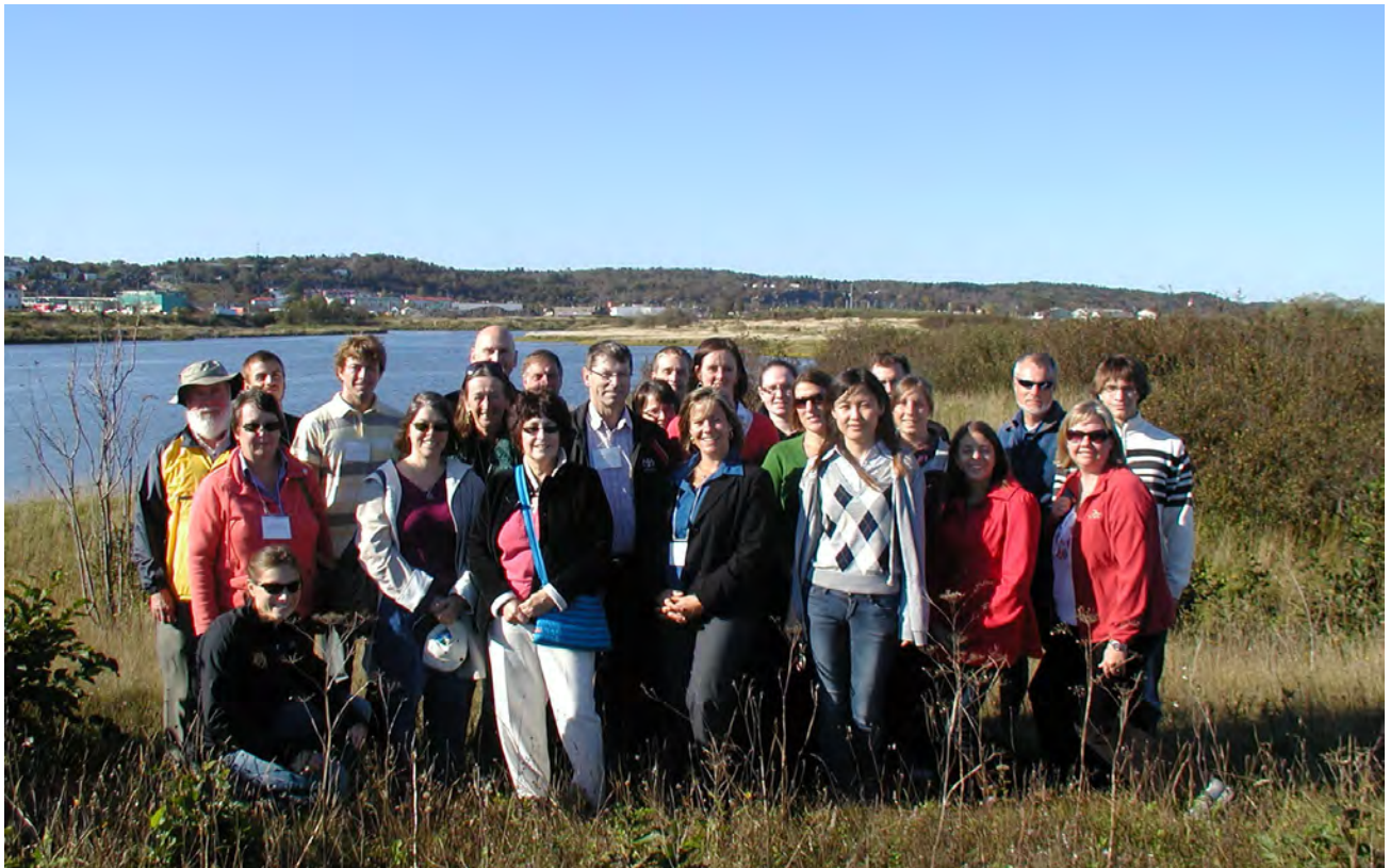
Below: Field trip participants (plus Peter Wells photographer).